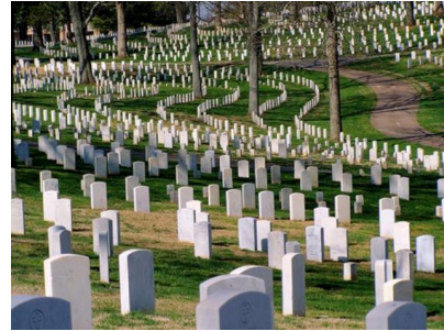
Marietta National Cemetery

Contact info is Marietta National Cemetery, 500 Washington Avenue, Marietta, GA 30060 Phone: (866) 236-8159 FAX: (770) 479-9311.