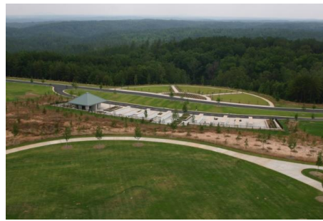
Georgia National Cemetery

Contact info is Georgia National Cemetery, 1080 Veterans Cemetery Road, Canton, GA 30114 Phone: (866) 236-8159 or (770) 479-9300 Fax: (770) 479-9311; Mailing Address: 2025 Mount Carmel Church Lane, Canton, GA 30114