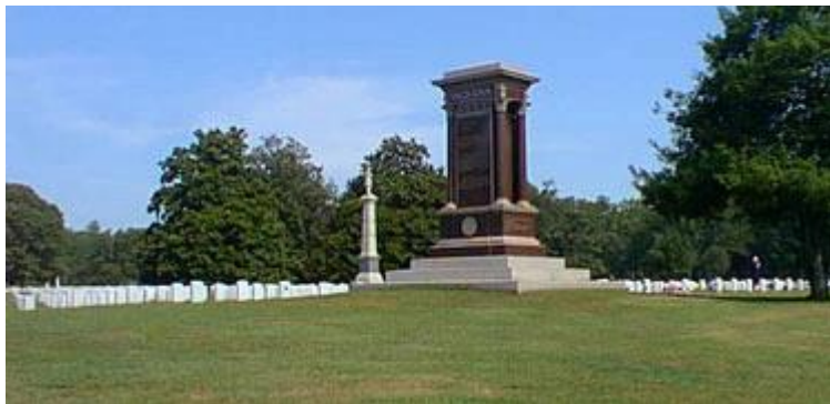
Andersonville National Historic Site

Contact info is Georgia National Cemetery, 1080 Veterans Cemetery Road, Canton, GA 30114 Phone: (866) 236-8159 or (770) 479-9300 Fax: (770) 479-9311; Mailing Address: 2025 Mount Carmel Church Lane, Canton, GA 30114