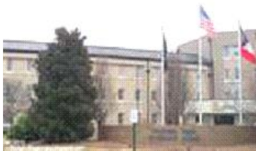
Georgia War Veterans Home -- 2249 Vinson Hwy, Milledgeville Tel: 478-445-6826.

The Home is situated on approximately 17 acres in Milledgeville, is a 375-bed facility licensed and certified by the U.S. Department of Veterans Affairs to provide skilled nursing care to aged and infirm Georgia war veterans. United Veteran Services of Georgia, Inc., a subsidiary of UHS-Pruitt Corporation of Norcross, operates the home for the Department of Veterans Service under a contractual agreement.